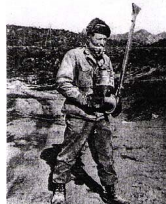
No. 1 Lice Killer Korea, 1952